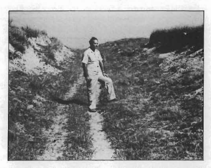
The author standing in the ruts of his ancestors at California Hill on the Oregon Trail, Nebraska