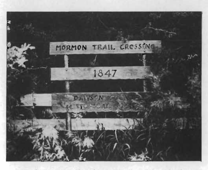
Nearly forgotten trail marker in Dawson County, Nebraska