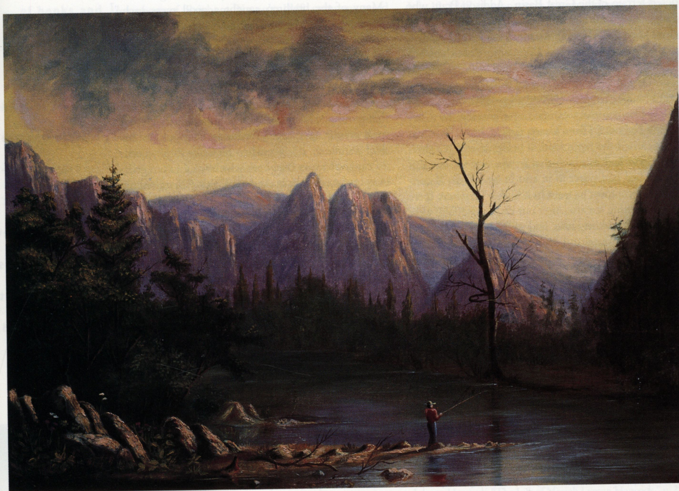
Weber River, 1870.